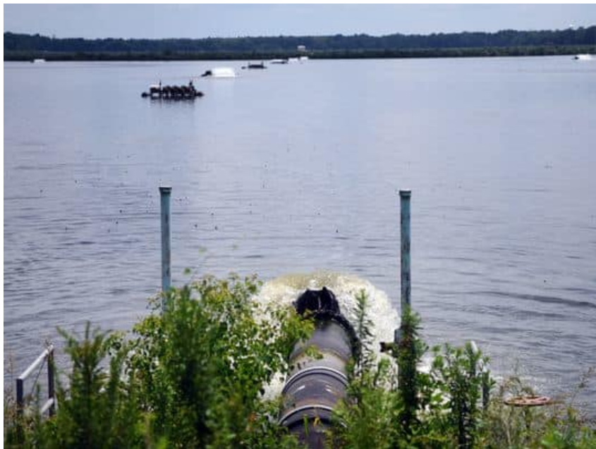
With Hattiesburg's current wastewater lagoons meeting permit levels for about a year, City Council members decided to see if the lagoons could be used as the city's sole wastewater treatment system.

The roller-coaster ride to a solution for Hattiesburg's wastewater woes continued in 2016.