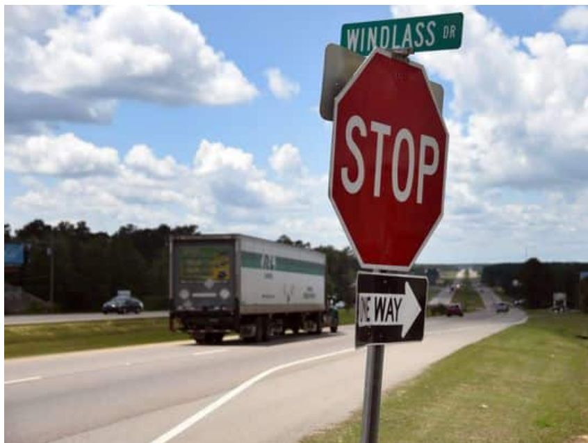
The Windlass Drive area would be included in Hattiesburg city limits if the proposed annexation is successful.

In late April, Hattiesburg City Council members proposed enlarging the Hub City's borders by way of annexation.