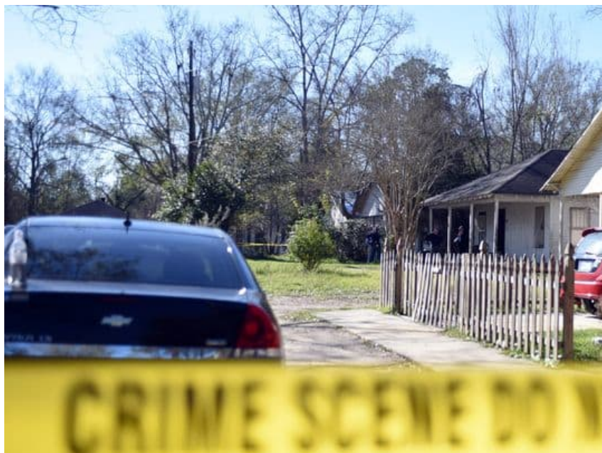
Hattiesburg saw eight homicides in 2016, including three within the first six days of the year.

Hattiesburg saw eight homicides in 2016 — three of them in the first six days alone.