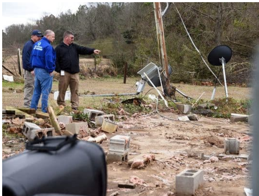
National Weather Service and emergency management officials look at debris from a tornado that hit Lamar County on Feb. 23.

Tornadoes and flooding were pre-eminent in the Pine Belt during the first quarter of the year. It all began with an EF2 tornado that hit the Rocky Branch community of Sumrall on Jan. 21, damaging several homes and one business. There were no injuries or fatalities reported, though 21 structures suffered damage.